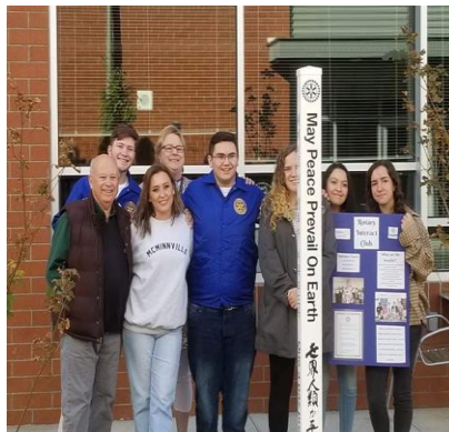
McMinnville Oregon High School

An important part of the Peace Pole planting is the Peace Pole Ceremony. The ceremonial gathering brings the community together and can include interfaith peace activities, concerts, tree plantings, exhibitions, speeches, picnics and activities for children.