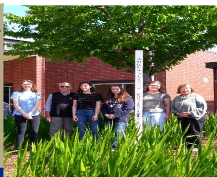
Central High School-Independence