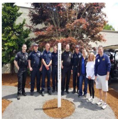
Peace Pole-Peace Officers